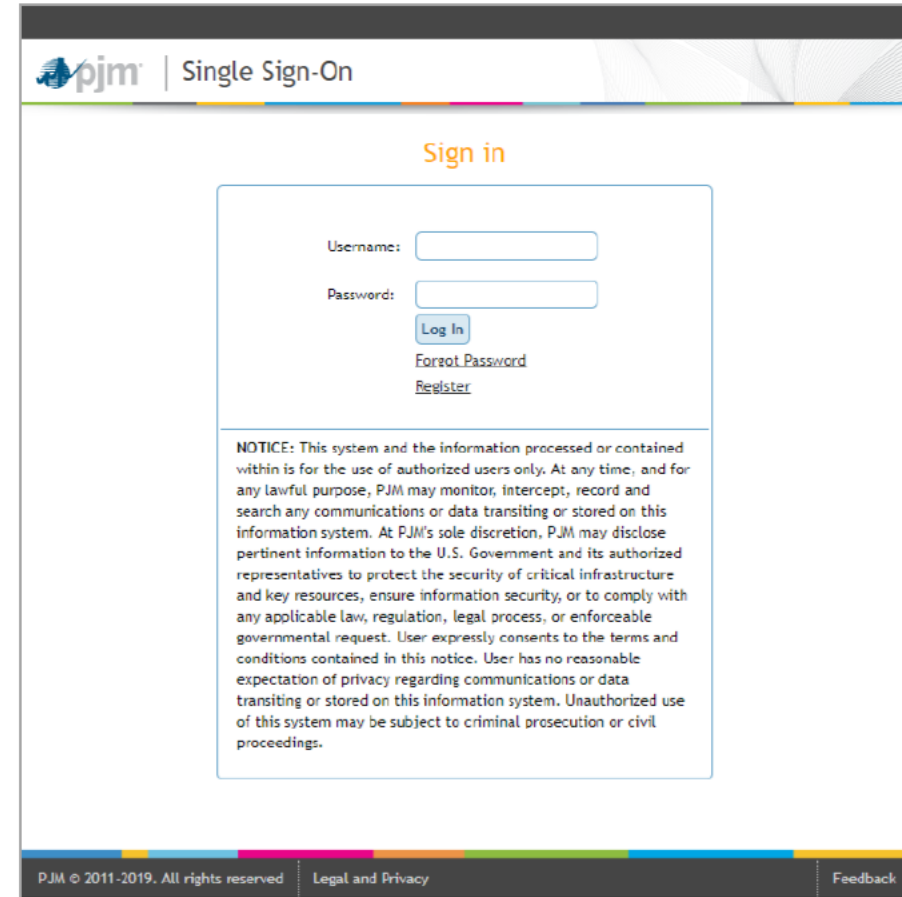
Ex. Windows Internet Explorer